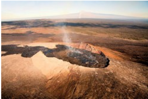
The Mount Kilauea volcano.